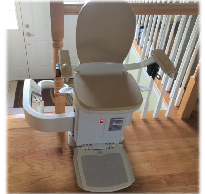
Stair-lifts and platform lifts