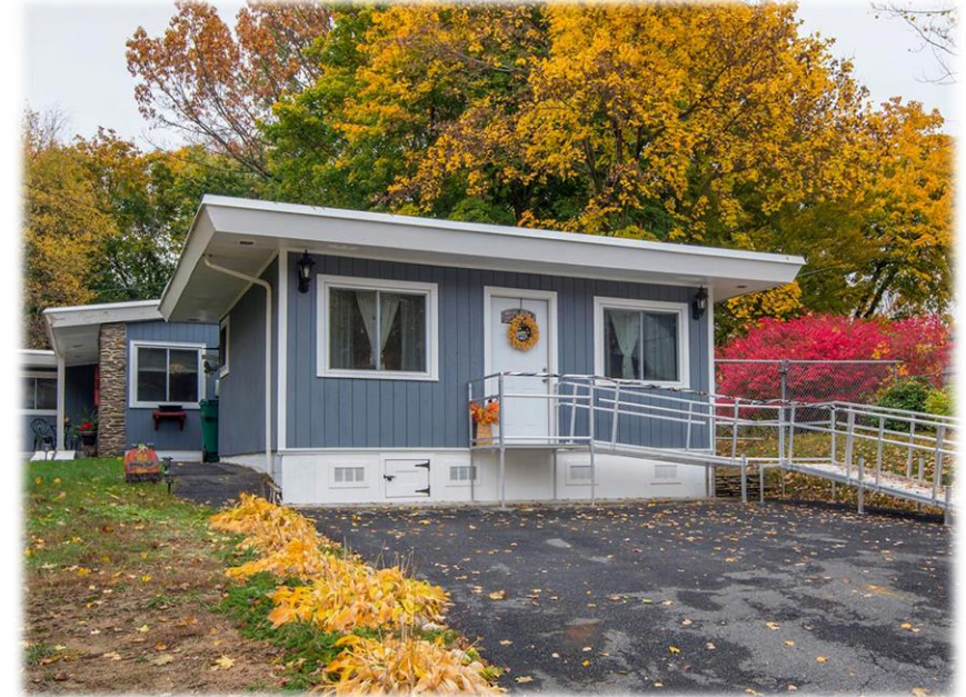
Accessory dwelling units