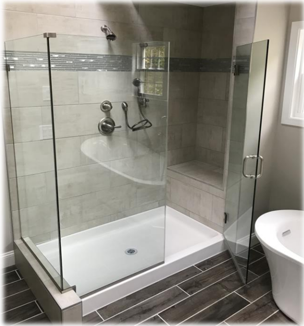
Bathroom modifications (walk-in showers, grab-bars, etc.)